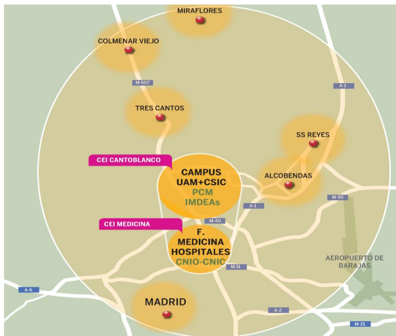
Geographic location and surrounding area of the CEI UAM+CSIC.

The UAM's Cantoblanco and Medical Campuses , which host the UAM+CSIC International Campus of Excellence (Campus de Excelencia Internacional, CEI), are located at the centre of a large, well-developed interurban area that offers well-being, good quality of life, excellent transport links and a privileged natural environment.